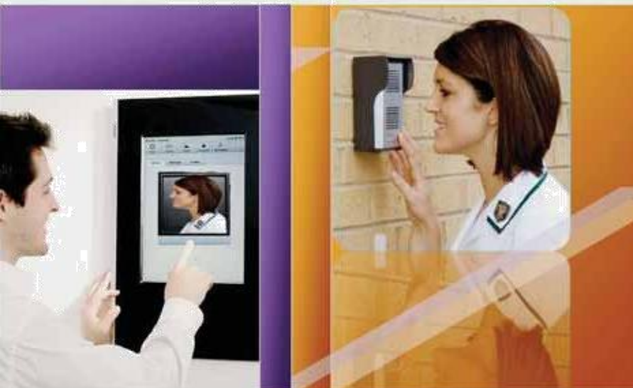
Main Door Video Calling Restricts unknown entry