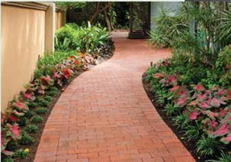
Walking Track Aesthetic and Refreshing