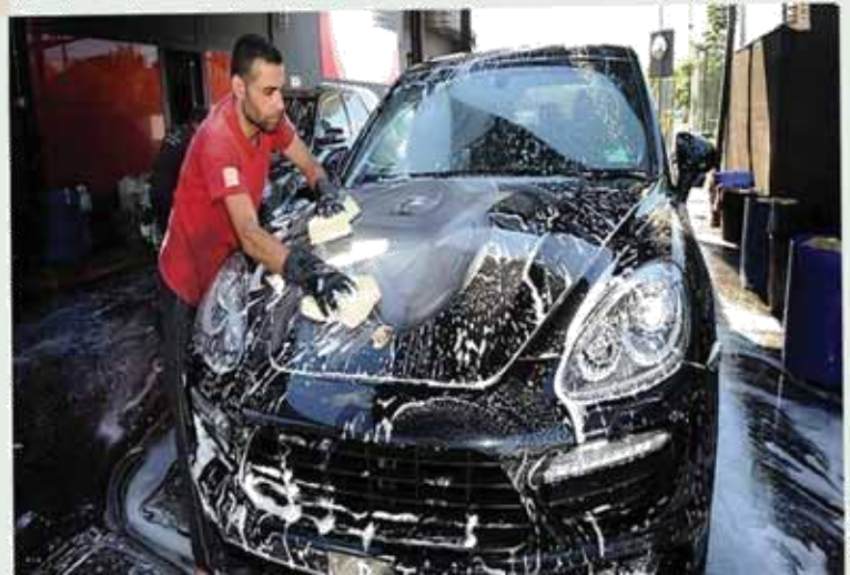
Car & Scooter Wash Area