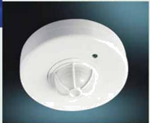
Occupational Sensors Warns every entry in the cellar from Sunset to Sunrise