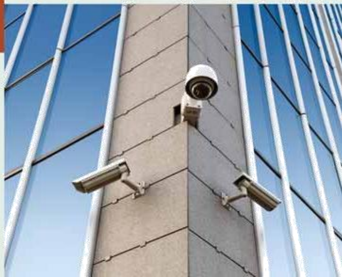
CCTV Surveillance Vigilance footage round the clock