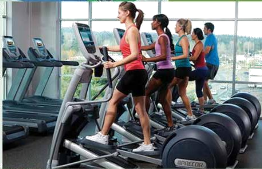
Modern Fitness Centre