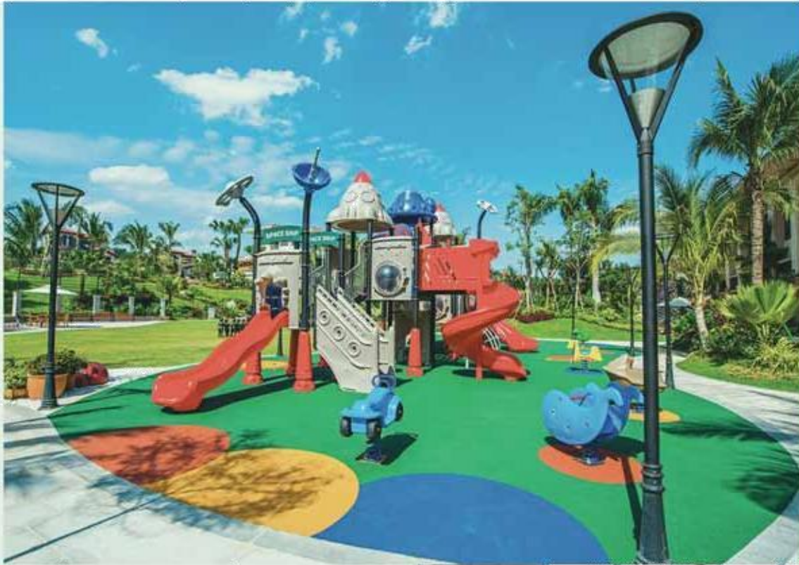
Choatic Children Play Area