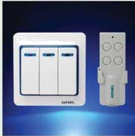
Remote Control Switches Functioning on Radio Frequency, covers 360° reach